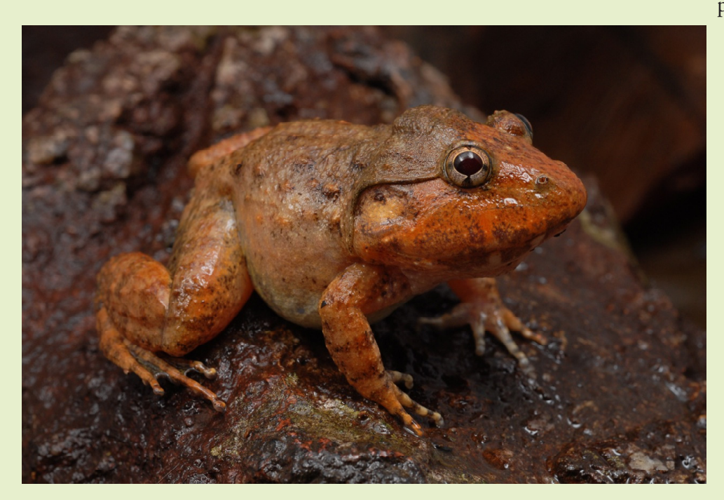
Limnonectes dabanus, Cambodia

pooling water and leaking, so I spent about an hour in the rain, trying to fix it. The river next to our camp had risen so much it was lapping at our feet, and everyone was sitting up with worried faces,