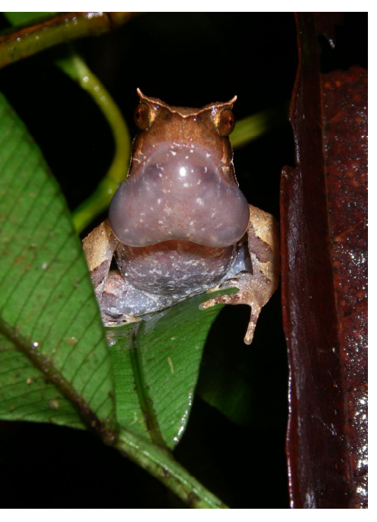
Ophryophryne sp. calling

22/7/07: Woke up at 4am. Had been in and out of sleep for some time, with the vague notion that