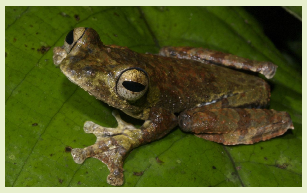
Rhacophorus sp. Vietnam

Thunder and lighting and all. Almost everyone instantly ran back to camp, but three of us continued our survey in the downpour until the stream was getting so full and fast that not even the frogs were braving it anymore.