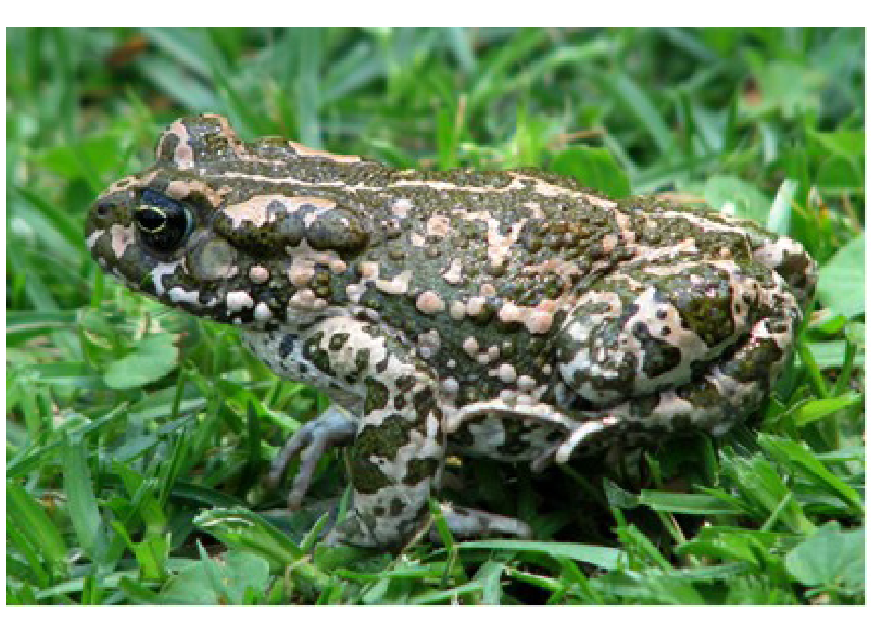
A female green toad recorded in a residential park

Department of Zoology, Tel-Aviv University, Ramat Aviv 69978, Israel