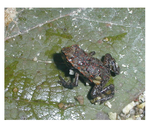
Bufo cristatus metamorph

The Amphibian Project is working with Amphibian Ark and Africam Safari (a zoo in Puebla, Mexico) to save the Critically Endangered Large-crested Toad ( Bufo cristatus ) from extinction. This rarely seen species was thought to be extinct until just recently. A field survey conducted by Africam Safari and partners located a number of tadpoles and metamorphs which confirmed the existence of this species in the wild.