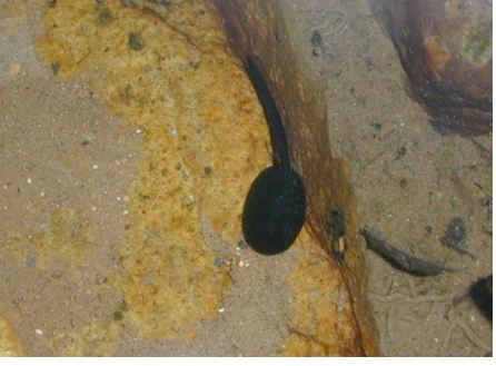
Bufo cristatus tadpole

To ensure the survival of the Large-crested Toad, The Amphibian Project is supporting Africam Safari in setting up a captive breeding program and education and awareness campaign for this species in Mexico. The Amphibian Project is also engaging school teachers in the U.S. to raise awareness about the global amphibian crisis and raise funds for the Africam project.