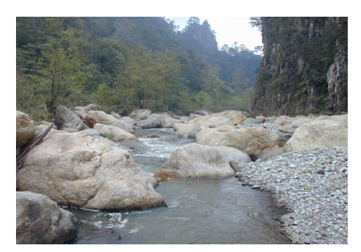
Bufo cristatus habitat

The Amphibian Project is a collaboration of five conservation professionals brought together by the Emerging Wildlife Conservation Leaders program. To learn more about Africam Safari or The Amphibian Project or to support the protection of the Largecrested Toad visit www.helpafrog.org.